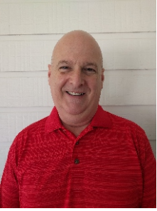
Sherman Armstrong Briscoe Unit