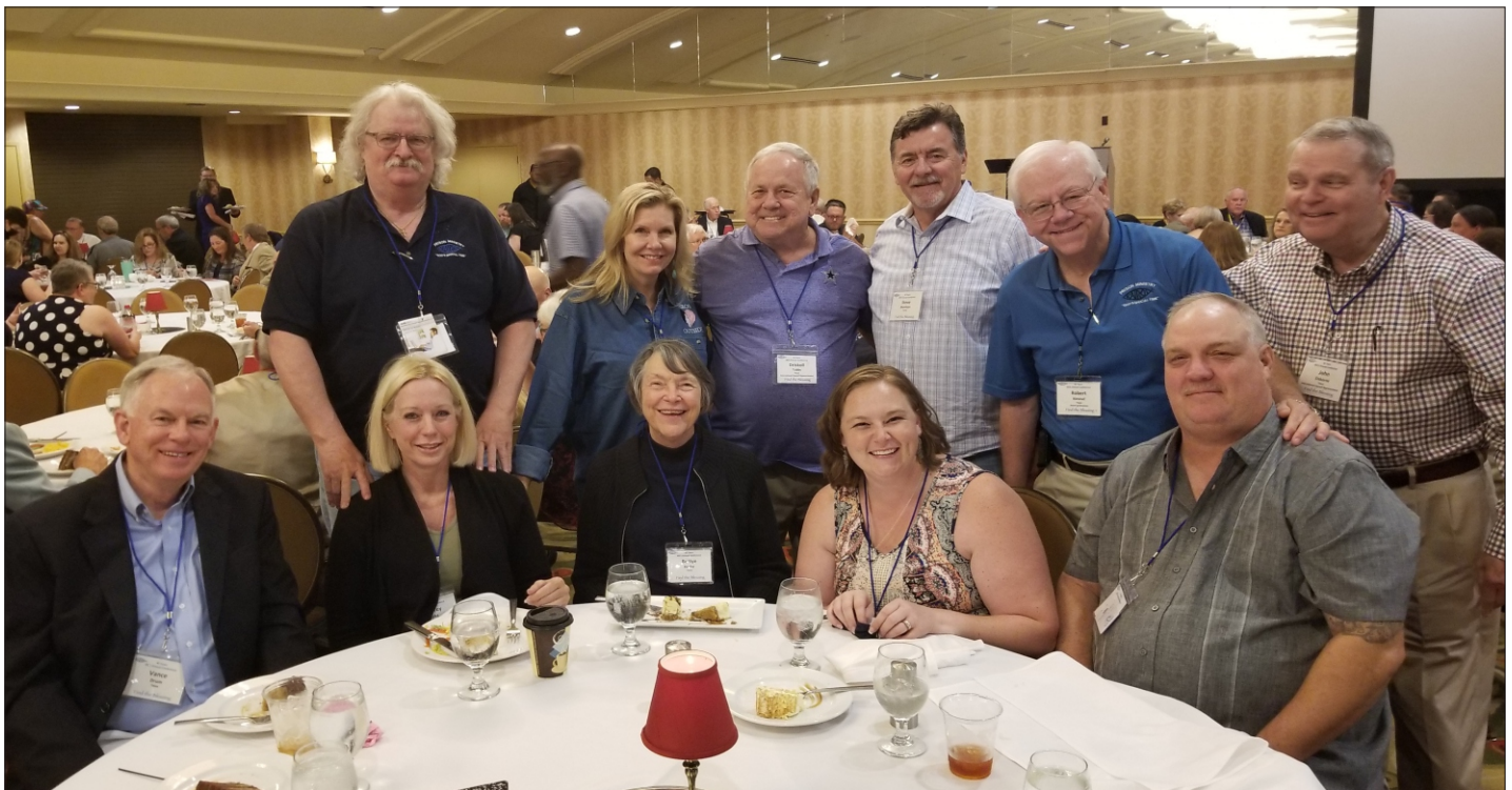
Texas Group at KPMI Conference in July

In short, our Kairos ministry in Texas is “energized” and well.