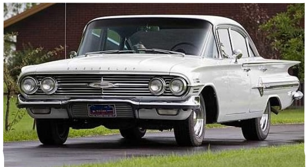
1960 White Chevrolet

ENJOY LIFE NOW - IT HAS AN EXPIRATION DATE!